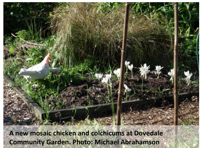
A new mosaic chicken and colchicums at Dovedale Community Garden.