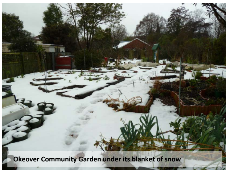
Okeover Community Garden under its blanket of snow