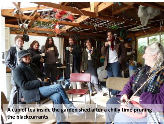
A cup of tea inside the garden shed after a chilly time pruning the blackcurrants