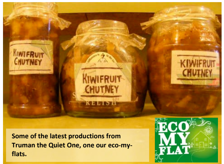
Some of the latest productions from Truman the Quiet One, one our eco-my-flats.

http://www.sustain.canterbury.ac.nz/summer/index.shtml .