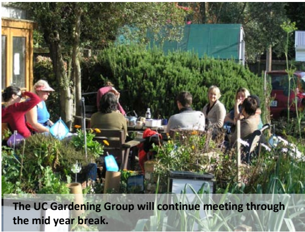
The UC Gardening Group will continue meeting through the mid year break.