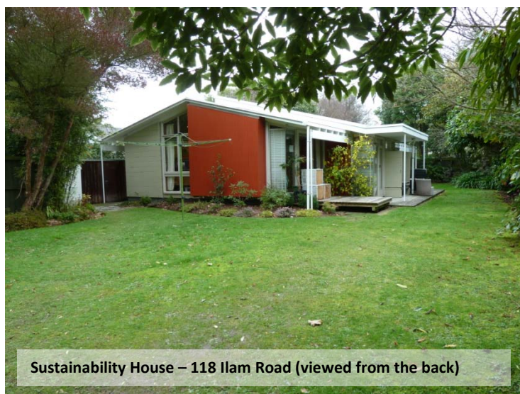
Sustainability House – 118 Ilam Road (viewed from the back)

We are on Facebook so please join our community by "liking" us at http://www.facebook.com/ucsustainabilitycommunity/