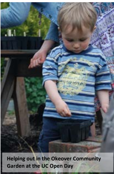
Helping out in the Okeover Community Garden at the UC Open Day