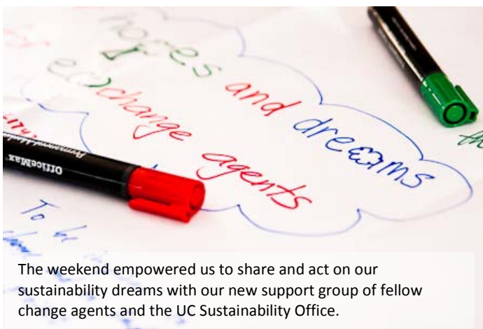
The weekend empowered us to share and act on our sustainability dreams with our new support group of fellow change agents and the UC Sustainability Office.