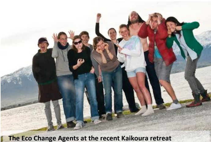
The Eco Change Agents at the recent Kaikoura retreat

Don't forget that if you're a student thinking about doing postgrad studies next year, you can apply for one of four awesome sustainability scholarship projects. Check them out: http://www.sustain.canterbury.ac.nz/summer/index.shtml