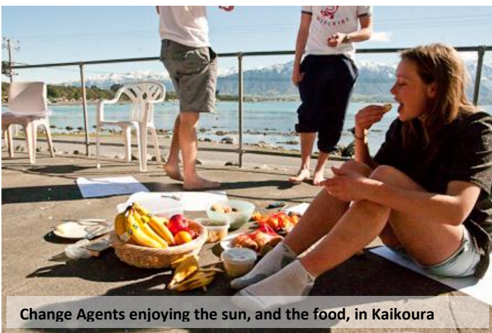
Change Agents enjoying the sun, and the food, in Kaikoura