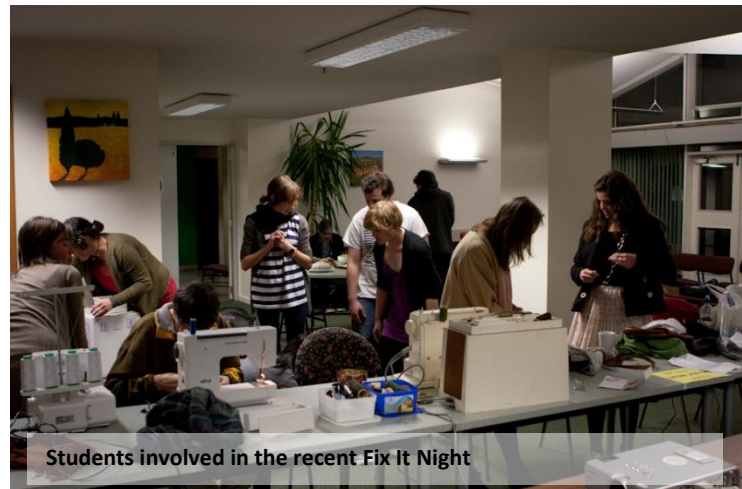
Students involved in the recent Fix It Night