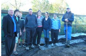
The team after the successful first attempt