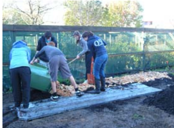
Spreading fermented food scraps onto a layer of rotted leaves