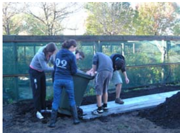
Students carefully positioning wheellie bin

The UC Sustainability Office celebrated the end of term and World Environment Day with a cool party at the New Common Room, Ilam Apartments. During the celebrations we awarded the prizes to the winners of eco-my-flat. Many thanks to the sponsors of the event: Silk Road Catering, Yealands Estate, South City New World, Greenhorn Productions, M*A*S*S*I*V*E & Campus Living Villages.